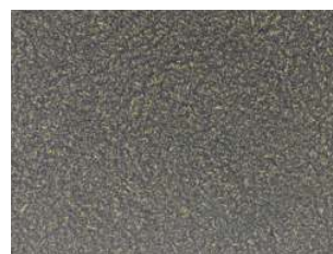
RHX-910 Shadow Oak