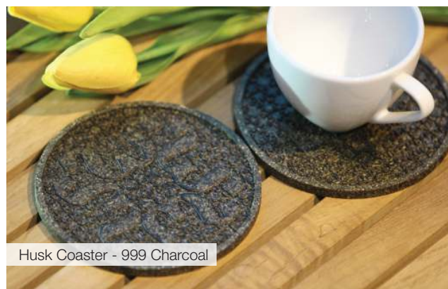
Husk Coaster - 999 Charcoal