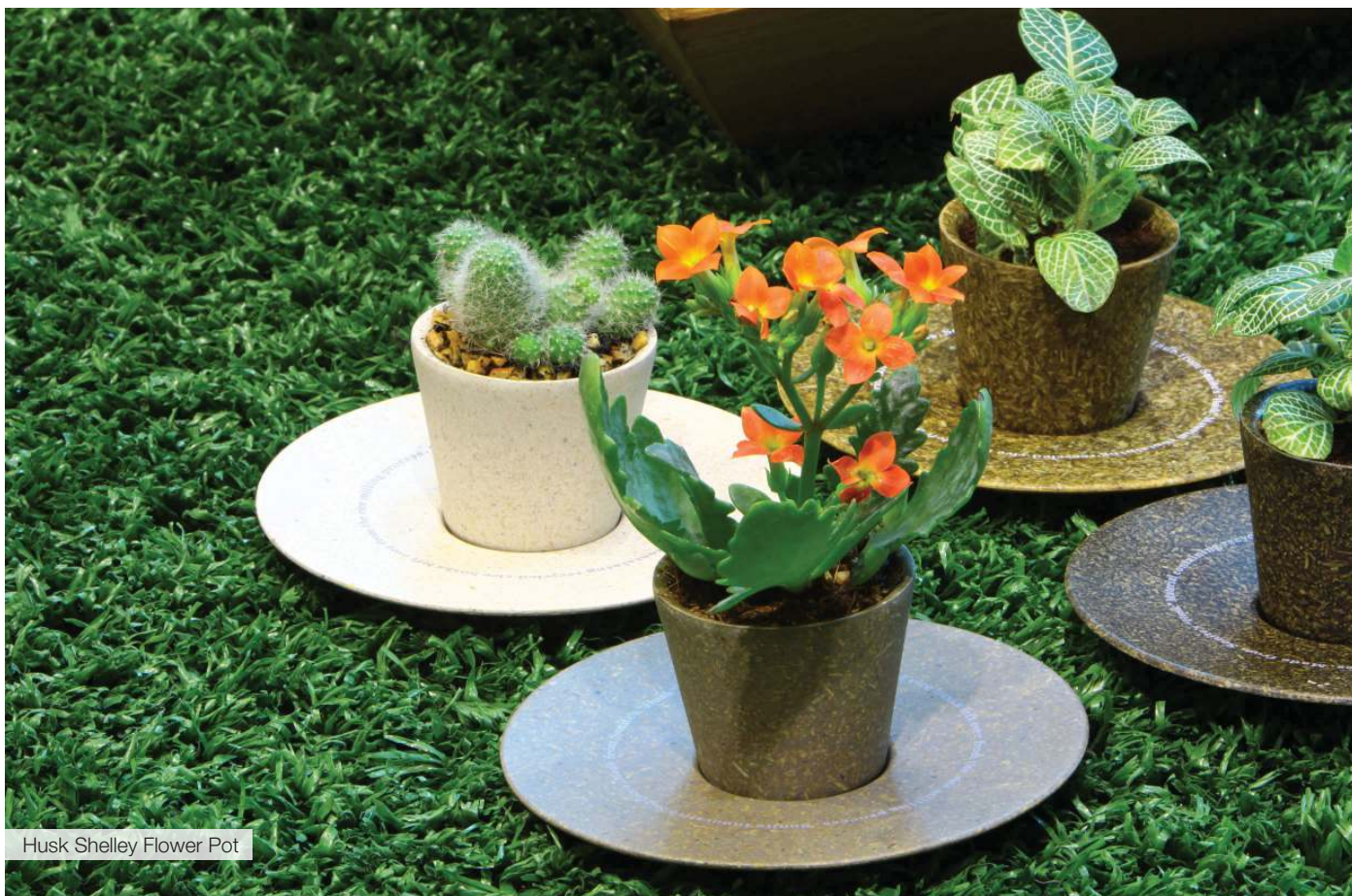
Husk Shelley Flower Pot