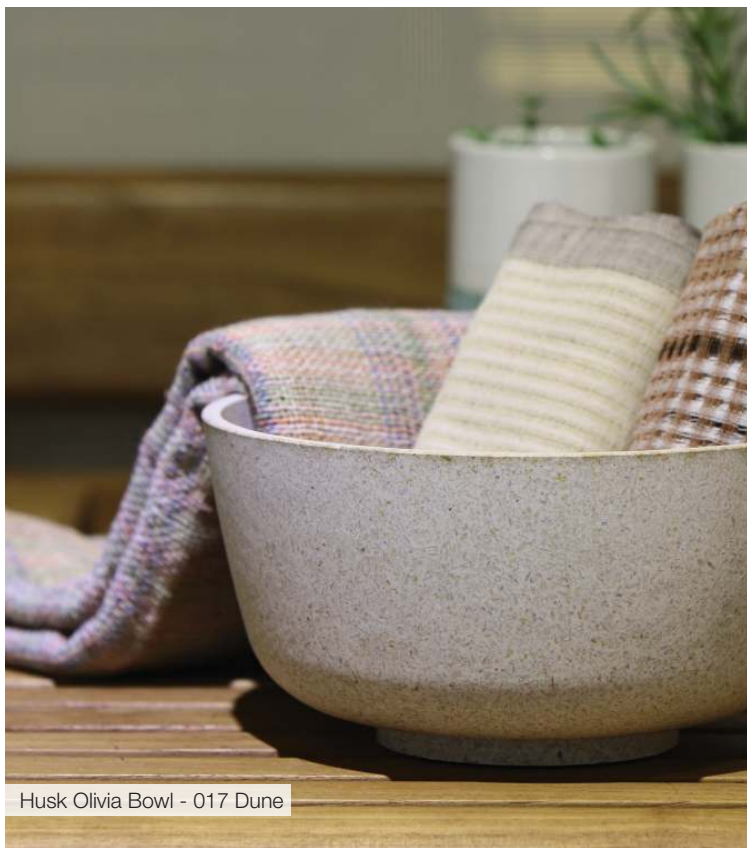
Husk Olivia Bowl - 017 Dune