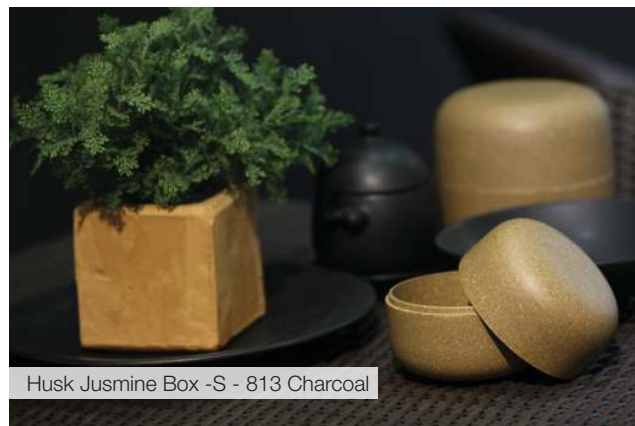
Husk Jusmine Box -S - 813 Charcoal